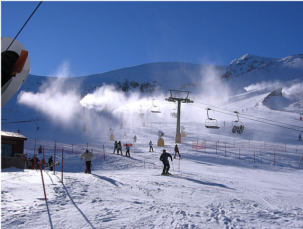
Figure 1: Artificial snow production in the Valdezcaray resort, Spain. November 2005. (photo released into the public domain)