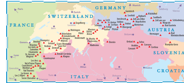
Figure 3: Alpine ski-resort map.